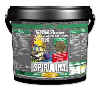
JBL Spirulina Premium main food for algaeeating aquarium fish