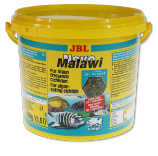
JBL NovoMalawi Main food flakes for algaeeating cichlids