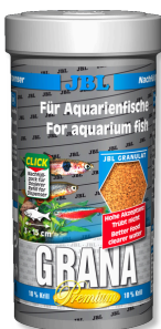
JBL Grana Premium main food granulate for small aquarium fish