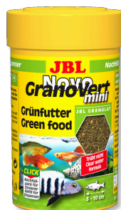
JBL NovoGranoVert mini

Main food granulate for plant-eating fish