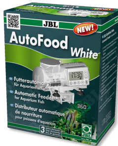
JBL AutoFood WHITE White automatic feeder for aquarium fish