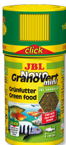
JBL NovoGranoVert mini CLICK

Main food granulate for plant-eating fish