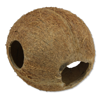
JBL Cocos Cava Coconut cave for aquariums and terrariums