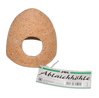
JBL Ceramic spawning cave Ceramic cave for freshwater aquariums