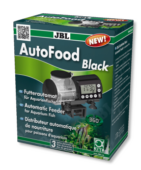
JBL AutoFood BLACK Black automatic feeder for aquarium fish