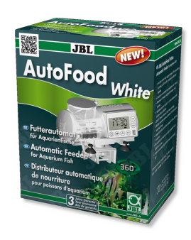
JBL AutoFood WHITE White automatic feeder for aquarium fish