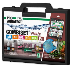
JBL PROAQUATEST COMBISET Plus Fe Test case with most important water tests + iron test