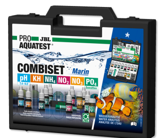
JBL PROAQUATEST COMBISET Marin Test case for water analyses in marine aquariums