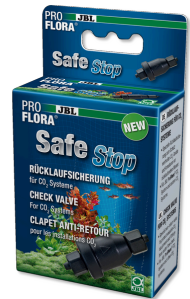
JBL PROFLORA SafeStop Water backflow stop for CO2 systems