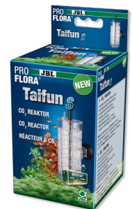
JBL PROFLORA Taifun S Extendable CO2 diffuser for small aquariums