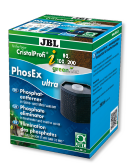
JBL PhosEx Ultra CristalProfi i60/80/100/200

Filter insert with activated carbon for CP i range