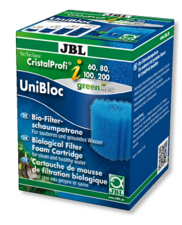
JBL UniBloc CristalProfi i60/80/100/200

Biological nitrate remover for CristalProfi i filters