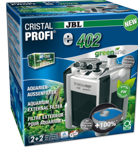
JBL CRISTALPROFI e402 greenline

External filter for aquariums of 40-120 litres