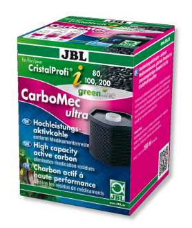
JBL CarboMec ultra Pad CristalProf i60/80/100/200

High-performance filter balls for CristalProfi i