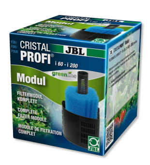
JBL CRISTALPROFI i greenline module

Water outlet with wide jet pipe for internal filters