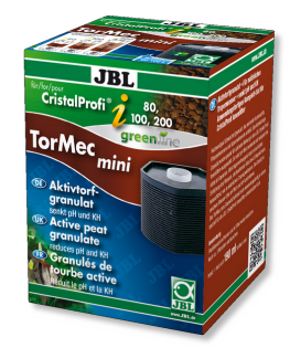
JBL Tormec CristalProfi i60/80/100/200

Nitrite, nitrate and phosphate eliminator for CP i