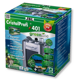
JBL CristalProfi e401 greenline

External filter for aquariums from 90 - 300 litres