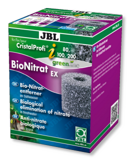
JBL BioNitrat Ex CristalProfi i60/80/100/200

Active peat granulate for CristalProfi i