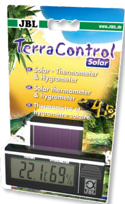
JBL TerraControl Solar Solar-powered thermometer + hygrometer for terrariums