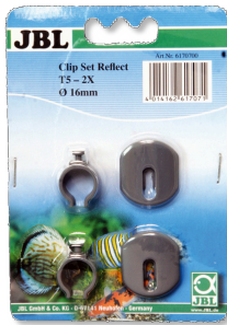
JBL SOLAR REFLECT Clip Set Holder for fluorescent tubes