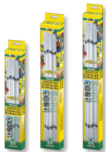
JBL SOLAR Reflect T5/ T8 - 895-1500 mm Reflector panel for fluorescent tube