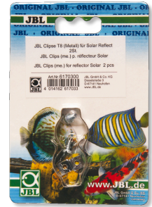
JBL Clips T5/T8 (Metal) Metal holder for fluorescent tubes