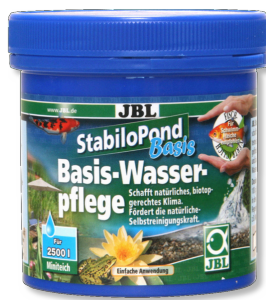
JBL StabiloPond Basis Basic care product for all garden ponds