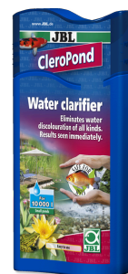
JBL CleroPond Water clarifier for the elimination of water cloudiness