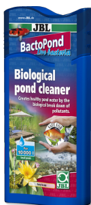
JBL BactoPond Bacteria for biological purification of the pond