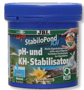
JBL StabiloPond KH pH balancer for garden ponds