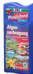
JBL PhosEX Pond Direct Phosphate remover for ponds