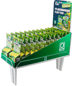
JBL tray 381 x 186 x 30mm