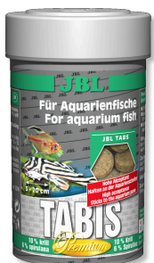
JBL Tabis Premium food tablets for freshwater and marine fish