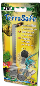
JBL TerraSafe Lock for terrarium pane