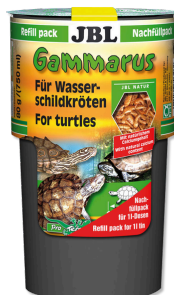
JBL Gammarus Refill pack Treats for turtles from 10 to 50 cm