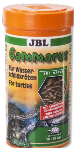
JBL Gammarus Treats for turtles from 10 to 50 cm