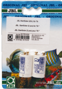
JBL Start Solar Starter for T8 fluorescent tubes