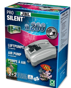
JBL PROSILENT a200 Air pump for fresh and saltwater aquariums