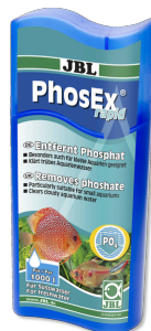
JBL PhosEx rapid Phosphate remover for freshwater aquariums