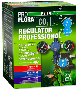
JBL PROFLORA CO2 REGULATOR PROFESSIONAL Pressure regulator with 2 displays & valve for CO2