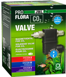
JBL PROFLORA CO2 VALVE CO2 solenoid valve for regulated CO2 addition