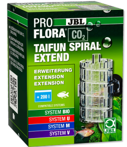
JBL PROFLORA CO2 TAIFUN SPIRAL EXTEND Extension for JBL PROFLORA CO2 TAIFUN SPIRAL 5 / 10