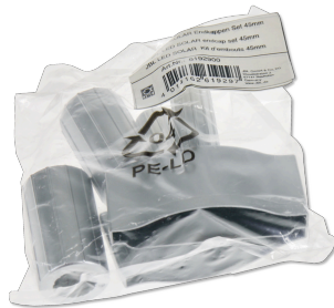
JBL LED SOLAR end cap set