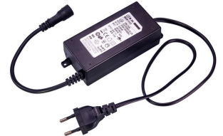
JBL LED SOLAR Driver