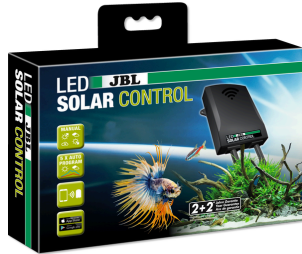
JBL LED SOLAR CONTROL