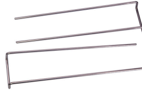
JBL LED SOLAR Holding Bracket Set