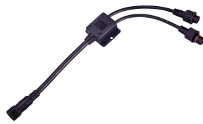
JBL LED SOLAR Y- Cable Switch