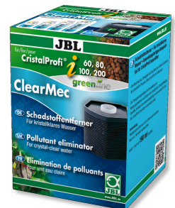
JBL Clearmec CristalProfi i60/80/100/200 Nitrite, nitrate and phosphate eliminator for CP i