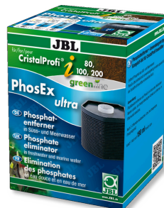
JBL PhosEx Ultra CristalProfi i60/80/100/200 Phosphate remover cartridge for JBL CristalProfi i