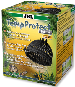
JBL TempProtect light Reptile thermal burn protection for JBL TempSets