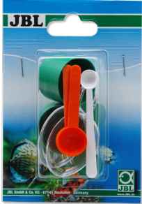
JBL spoon set 2x 0.3ml/1.5ml/5ml/17ml