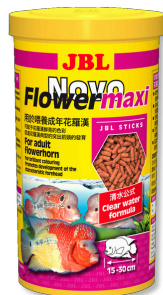
JBL NovoFlower maxi Complete food for Flowerhorn cichlids from 12 cm upwards