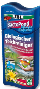
JBL BactoPond Bacteria for biological purification of the pond