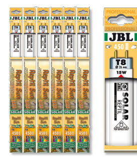
JBL SOLAR REPTIL SUN T8 Special T8 terrarium fluoresc. tube for desert animals