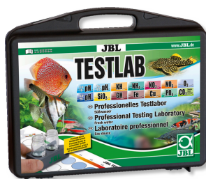
JBL Testlab Test case with 13 tests f. freshwater analysis Testlab