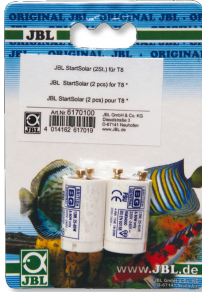
JBL Start Solar Starter for T8 fluorescent tubes