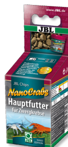
JBL NanoCrabs Main food for dwarf crayfish