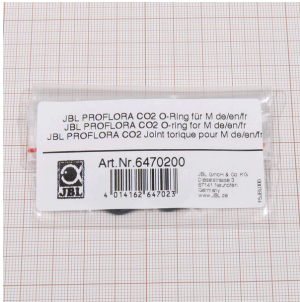
JBL PROFLORA CO2 O- ring for m