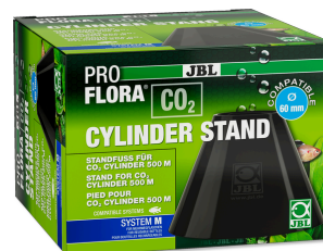
JBL PROFLORA CO2 CYLINDER STAND Stand for 500 g CO2 cylinders