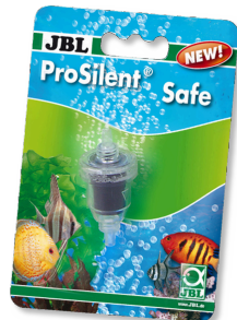
JBL ProSilent Safe