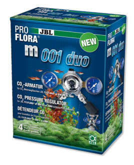
JBL PROFLORA m001 duo

Fitting to reduce pressure for 2 CO2 diffusers