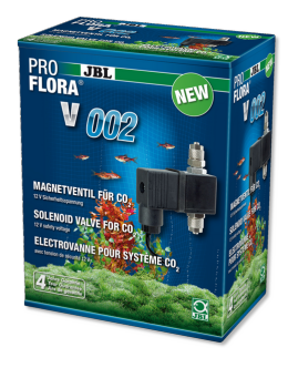
JBL PROFLORA v002

Fitting to reduce pressure for 2 CO2 diffusers