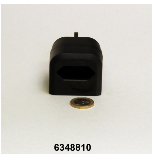
JBL adapter UK for all flat-pin plugs