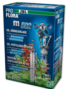
JBL PROFLORA m502 CO2 plant fertiliser system with night switch-off