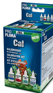
JBL PROFLORA Cal Complete kit for calibration