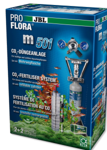
JBL PROFLORA m501 CO2 plant fertiliser system complete kit