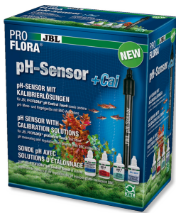
JBL PROFLORA pH-Sensor+Cal pH electrode with BNC connection