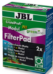
JBL CP m greenline FilterPad module

Spare sponge for CristalProfi m internal filter