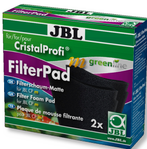
JBL CP m greenline FilterPad

Spare sponge for CristalProfi m internal filter