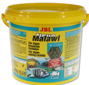
JBL NovoMalawi Main food flakes for algae-eating cichlids