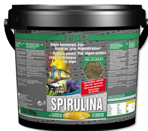
JBL Spirulina Premium main food for algae-eating aquarium fish