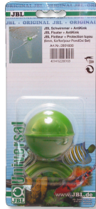
JBL Floater + AntiKink Floater with anti-kink protection for PondOxi-Set