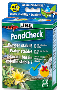
JBL PondCheck Quick test to determine the pH and KH values