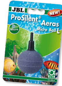
JBL ProSilent Aeras Micro Ball L Air stone for fine air bubbles