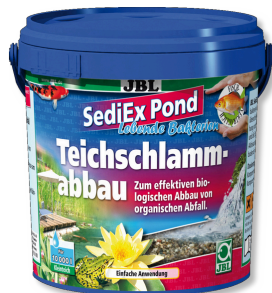
JBL SediEx Pond Bacteria and active oxygen for the breakdown of sludge