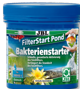
JBL FilterStart Pond Bacteria starter for pond filters