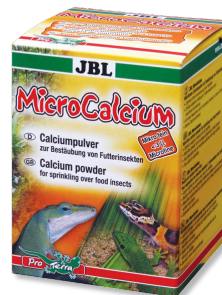
JBL MicroCalcium Mineral supplementary food for all reptiles