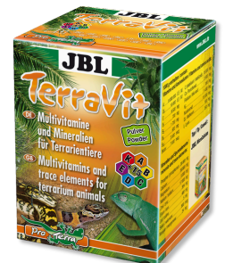
JBL TerraVit Powder Vitamins and trace elements for terrarium animals