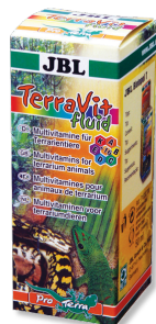
JBL TerraVit fluid Vitamins and trace elements for terrarium animals