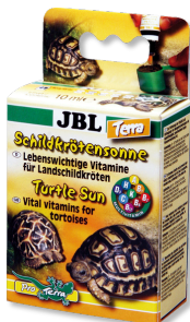
JBL Tortoise Sun Terra Vitamins for tortoises