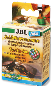
JBL Turtle Sun Aqua Vitamins for turtles and pond terrapins