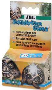
JBL Tortoise shell care Shell care for tortoises