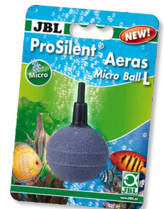
JBL ProSilent Aeras Micro Ball L Air stone for fine air bubbles