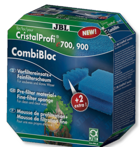
JBL CombiBloc CristalProfi e Pre-filter pads and filter foam for CristalProfi e