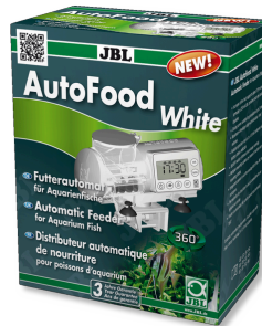
JBL AutoFood WHITE White automatic feeder for aquarium fish