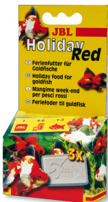
JBL Holiday Red Complete holiday food for goldfish