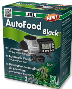
JBL AutoFood BLACK Black automatic feeder for aquarium fish