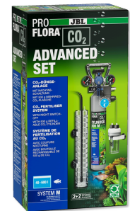
JBL PROFLORA CO2 ADVANCED SET M CO2 plant fertilis. system compl. set+night switch-off