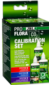
JBL PROFLORA CO 2 CALIBRATION SET To calibrate and store pH electrodes