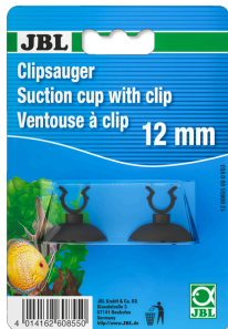
JBL suction cup with clip, 12 mm Rubber suction pads with clips for objects with 12 mm