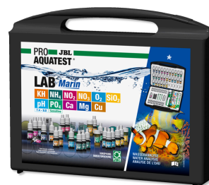
JBL PROAQUATEST LAB Marin Professional test case for marine water analysis