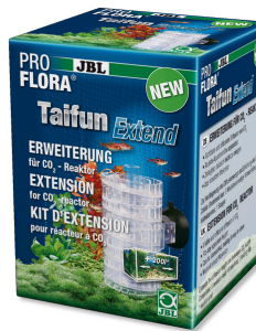
JBL PROFLORA Taifun Extend Extension for CO 2 high-performance diffuser