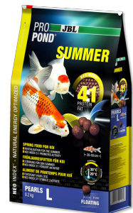
JBL PROPOND SUMMER L Summer food for large koi