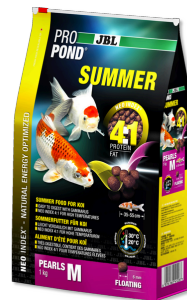
JBL PROPOND SUMMER M Summer food for medium-sized koi