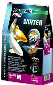
JBL PROPOND WINTER M Winter food for medium-sized koi