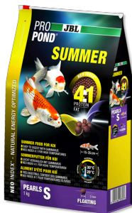
JBL PROPOND SUMMER S Summer food for small koi