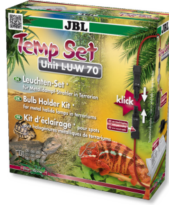
JBL TempSet Unit L-U-W Installation kit for metal-halide lamps