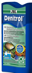
JBL Denitrol Bacteria starter for adding aquarium fish