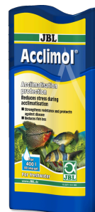
JBL Acclimol Water conditioner for acclimatisation