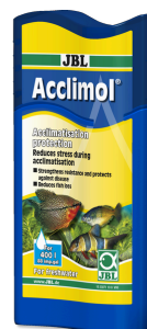
JBL Acclimol Water conditioner for acclimatisation