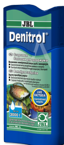
JBL Denitrol Bacteria starter for adding aquarium fish